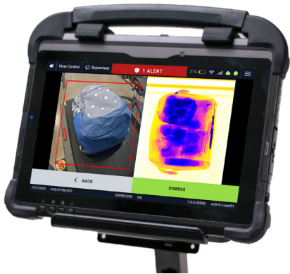
This image is for illustration purposes only and may be updated or modified.

Evolv eXpedite is designed to autonomously scan the bags on the conveyor belt to detect potential threats. The system uses advanced AI and high-speed x-ray imaging technology to distinguish potential threats from many everyday items. If a threat is detected, the green lights on eXpedite turn red and the conveyor belt automatically stops. A connected tablet shows the bag's image with a "Red Box" to highlight the bag containing the potential threat and further X-ray image detail to aid resolution.