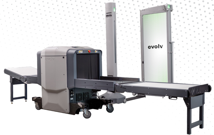
This image is for illustration purposes only and may be updated or modified.

Using Evolv eXpedite in conjunction with Express aims to allow Express to run at a higher sensitivity level with the goal to keep false alarm rates (FAR) low. This means that the combined solution is designed to detect more threats without putting an excess burden on security teams.